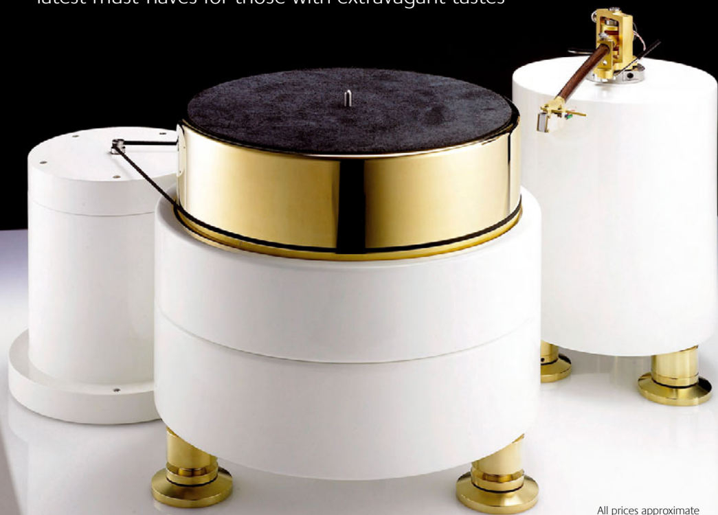
All prices approximate

Looking for a gift idea for someone who has everything? Or just a little treat for yourself? Nik Berg picks out a selection of the latest must-haves for those with extravagant tastes